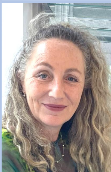
Cover Image – “Waratah Deconstructed” 2022 by Carmel Mackie.

Carmel used charcoal, watercolour, polyester thread, pins & beads in this artwork which demonstrates the expressive possibilities of thread in her art practice. The artwork features in Carmel’s solo exhibition, “Connecting Threads,” which is on display at Liverpool Powerhouse 13 September – 26 October.