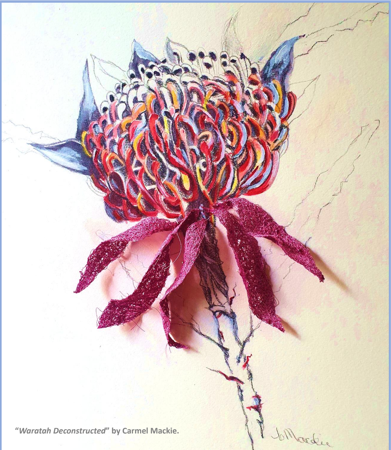
"Waratah Deconstructed" by Carmel Mackie.