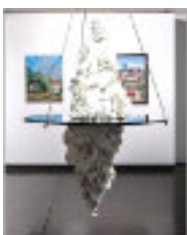
(Left) CBA PRIZE for Technical Excellence