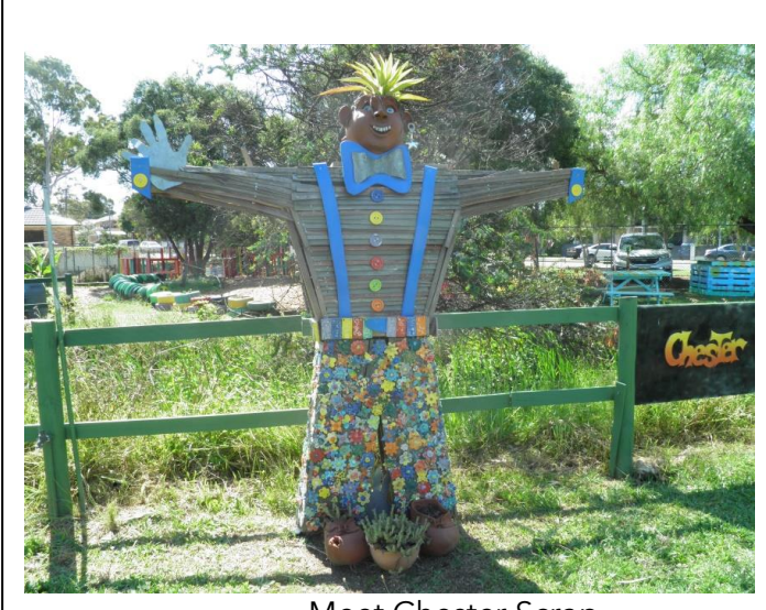
Meet Chester Scrap.

A competition was held to name the scarecrow, and from the many suggested names, one suited the scarecrow perfectly: Chester Scrap...after all his new home was the Chester Hill Garden Centre and he was made of 'scrap' from reverse garbage in fact.