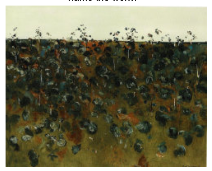
Answers at bottom of the page

The World's Greatest Australian Art Quiz Who created this work in 1965 and what did he name the work?